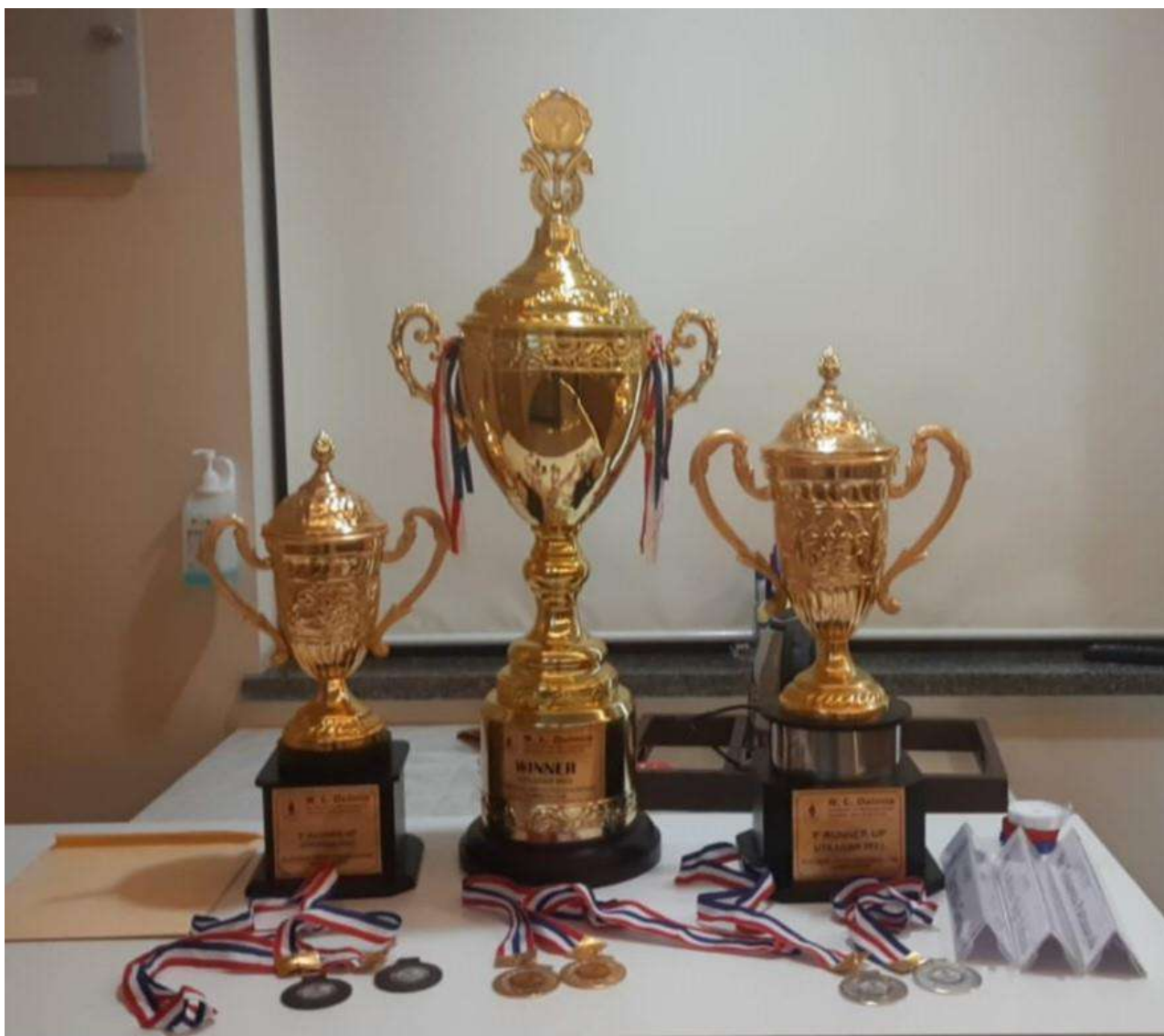
The glorious trophies for the winning teams

Utkarsh Committee of N. L. Dalmia Institute of Management Studies and Research, Mumbai organized the National Level B-School Paper Presentation competition 'Utkarsh', on 25th February 2023. The theme of the paper presentation for this year was ' Data and AI: Future of HR' '.