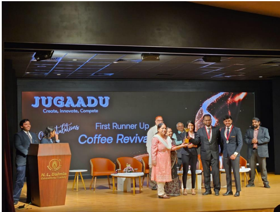
1 st Runner up team- - Coffee Revivalists (Café Coffee Day)