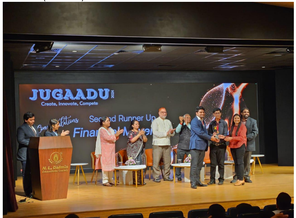
2 nd Runner up team- Financial Mavericks (Yes Bank)