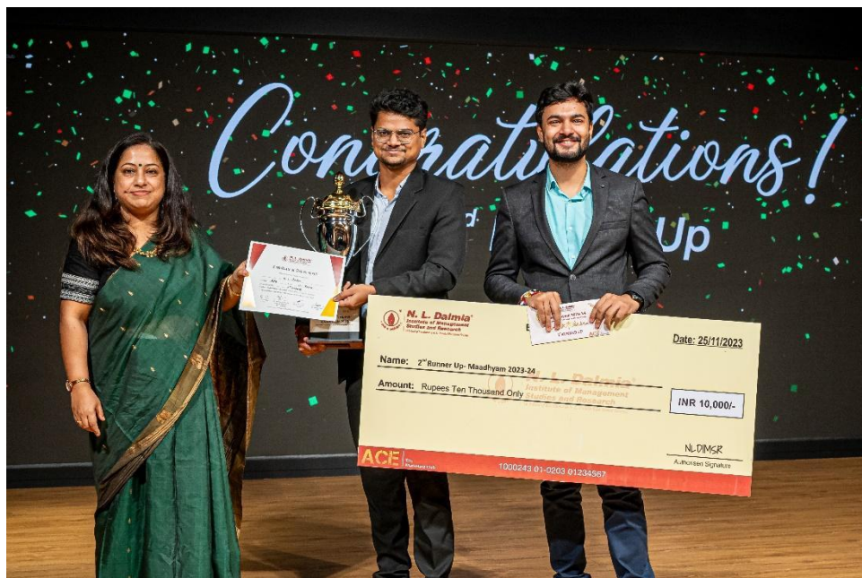
The second runner up for Maadhyam – Team Alpha