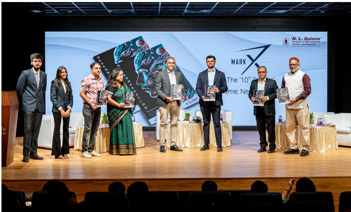
Unveiling of the 10 th Edition of MarkX