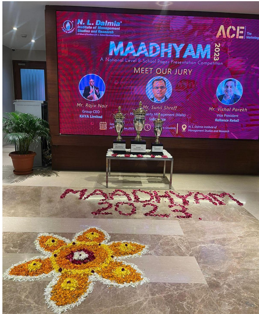
Trophies of Maadhyam 2023-24