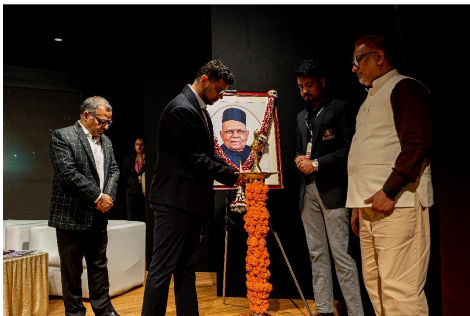
Lighting the lamp by the dignitaries